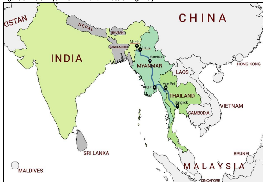
Figure 3: India-Myanmar-Thailand Trilateral Highway