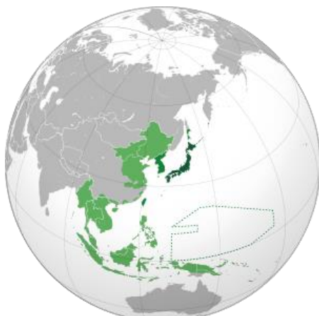
Figure 4: Greater East Asia Co-Prosperity Sphere 72

Japan before the Second World War was perceived in Japan and in the neighboring states (see below) and how it eventually became a means towards generating legitimacy for Japanese hegemony. A similar fate might befall the slogan of Chindia. It is not surprising that the concept comes up against considerable resistance in India's collective memory, impregnated with the old Indian slogan of 'Hindi-Chini-bhaibhai' which, for many Indians, is the single most important cause of India's disastrous performance in the 1962 border war with China.