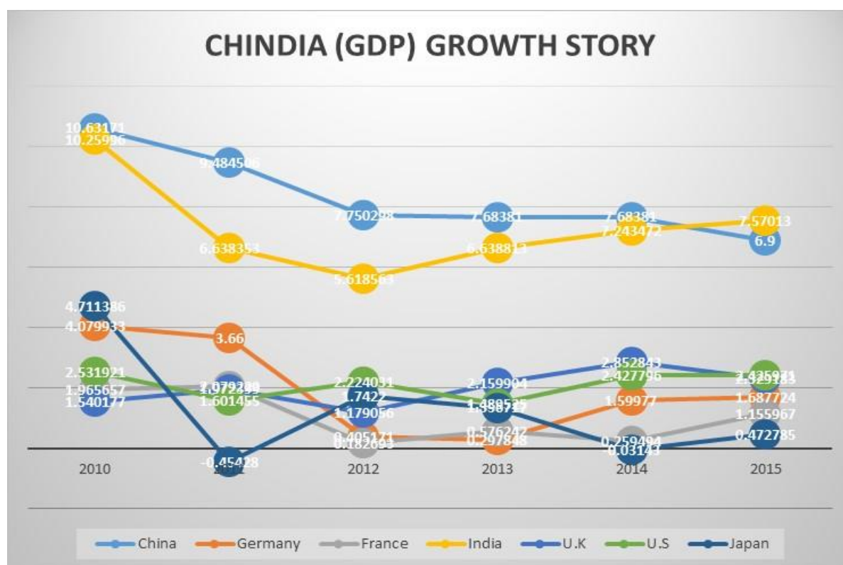
Figure 2: CHINDIA (GDP) GROWTH STORY

In order to understand the reasons behind Indian hesitation to cast Indian economic and strategic concerns within the larger framework of Chindia, one needs to look critically at the dynamics of Sino-Indian relations during the past decades.